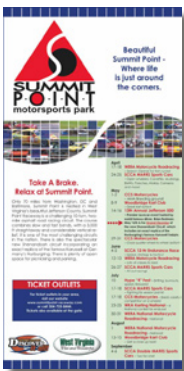
Frederick News Post

FLATWOODS DAYS INN: An attractive website was created that promotes Flatwoods Days Inn's conference center capabilities. Along with viewing room layouts, menu options and equipment lists, visitors can choose from these options while reserving a conference room online. Matching magazine ad, hotel signage and billboards complete the promotional package.