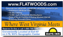
WV Executive Magazine